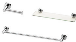
Radii 600mm Single Towel Rail, Toilet Roll Holder & Glass shower shelf in Chrome