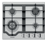
Westinghouse 600mm Gas Cooktop