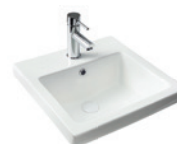
Seima Kyra 017 Square Basin