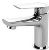
Phoenix Arlo Basin Mixer