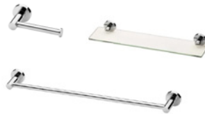
Radii 600mm Single Towel Rail, Toilet Roll Holder & Glass shower shelf in Chrome