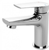
Phoenix Arlo Basin Mixer