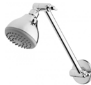
Ivy Shower Arm & Rose