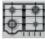
Westinghouse 600mm Gas Cooktop