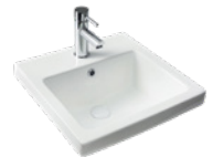
Seima Kyra 017 Square Basin