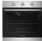
Westinghouse 600mm Electric Oven