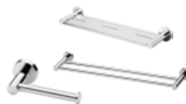
Phoenix Ralii accessories incl. shower shelf (RA886CHR) double towel rail (RA813CHR) toilet roll holder (RA892CHR)