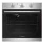
Westinghouse 600mm Electric Oven (WVE613SC)