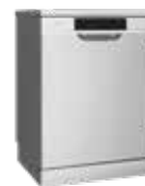
Westinghouse 600mm Freestanding Dishwasher (WSF6606XA)