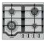
Westinghouse 600mm Gas Cooktop (WHG644SC)