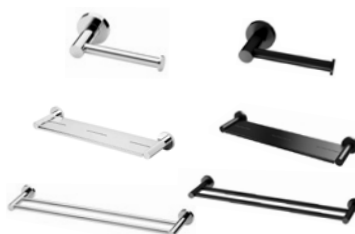
Phoenix Ralii accessories incl. shower shelf, double towel rail & toilet roll holder*