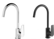
Phoenix Arlo Sink Mixer*