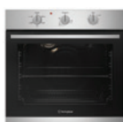
Westinghouse 600mm Electric Oven