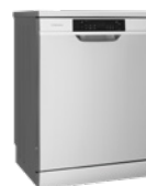
Westinghouse 600mm Dishwasher