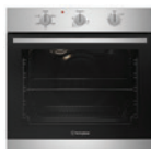
Westinghouse 600mm Electric Oven