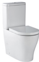
Seima Limni Toilet Suite with Classic Seat