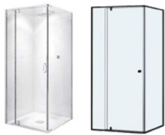
Semi frameless shower screen*