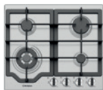
Westinghouse 600mm Gas Cooktop