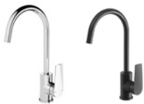
Phoenix Arlo Sink Mixer*