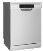
Westinghouse 600mm Dishwasher