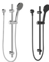
Phoenix Pina shower rail*