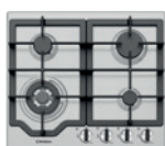
Westinghouse 600mm Gas Cooktop