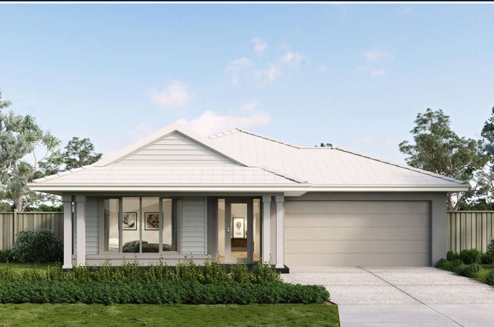
Image depicts items not supplied by Metricon namely landscaping, fencing, timber decking and paths. Image contains upgrade items.