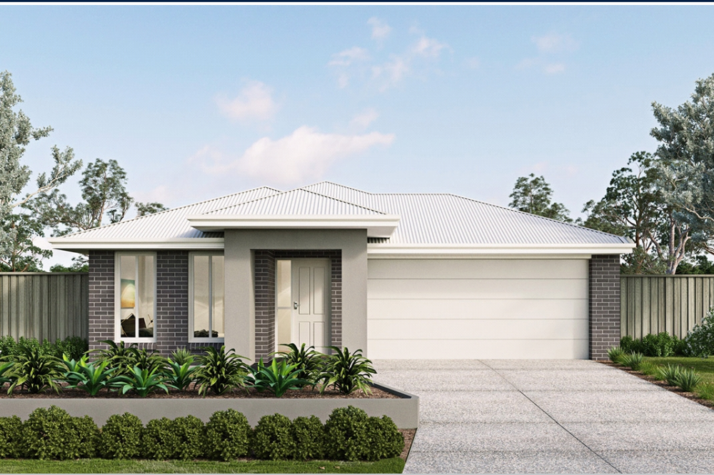
Image depicts items not supplied by Metricon namely landscaping, fencing, timber decking and paths. Image contains upgrade items.