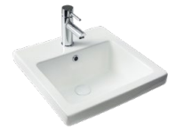
Seima Kyra 017 Square Basin