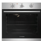
Westinghouse 600mm Electric Oven