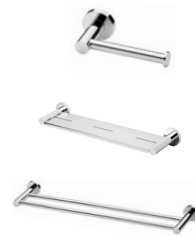
Phoenix Radii accessories incl. shower shelf, double towel rail & toilet roll holder*