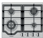
Westinghouse 600mm Gas Cooktop